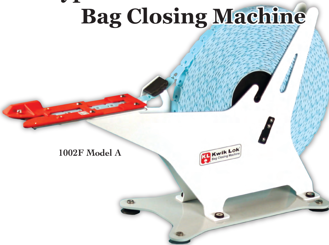
1002F Model A

The 1002F Model C features a Trodat® printer which uses "grooved, press-on" rubber type. Press-on type permits customizing of imprint copy. The 1002F Model D features a Trodat Band Printer for printing dates. Models C & D require the use of Series "RL" or "SL" closures. These closures are manufactured with a small paper label affixed to the closure. The 1002F Model A uses Kwik Lok's Series "R" and Series "S" Striplok® Bag Closures. The closures cannot be printed.