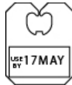
PRINT SAMPLE BAND PRINTER

BAND PRINTER PART NUMBER P18-00094 TRODAT® #5431 SHIPS WITH ONE BLACK INK PAD