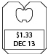
PRINT SAMPLE BLOCK PRINTER

BLOCK PRINTER PART NUMBER P18-00077 TRODAT® #4952 KIT INCLUDES 2 SETS OF RUBBER TYPE (5/32" & 1/8" TYPE HEIGHT) ONE BLACK INK PAD AND TWEEZERS