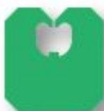
SERIES RLS (MEDIUM DUTY)