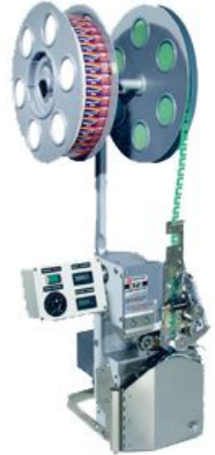
872 "LABELMASTER" AUTOMATIC BAG CLOSING MACHINE