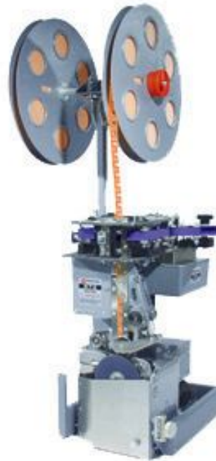
872 "ENCORE" AUTOMATIC BAG CLOSING MACHINE ALSO 873 STAINLESS STEEL (NOT SHOWN)