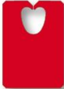
SERIES ZI (HEAVY DUTY)

These closures can be used on the 872 Encore, 872 Labelmaster and 873 Stainless Steel automatic bag closing machines. The closure can close packages up to 20 Lbs content weight. Closures are available in three plastic colors.