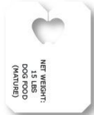
PRINTED SERIES YP (HEAVY DUTY)