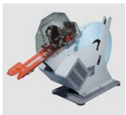
1002DP Semiautomatic with Printer

SERIES RL (MEDIUM DUTY) SERIES RLP (MEDIUM DUTY) SERIES SL (HEAVY DUTY) SERIES SLP (HEAVY DUTY)