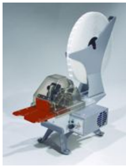
086 Semiautomatic with Printer