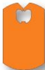
UNPRINTED SERIES A (MEDIUM DUTY) SERIES F (HEAVY DUTY)

Series G is identical to Series F except the closure is pre-printed at a Kwik Lok Factory with your text copy.