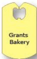
PRINTED SERIES B (MEDIUM DUTY) SERIES G (HEAVY DUTY)